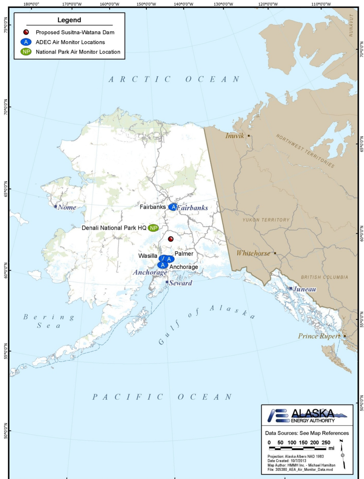
Figure 5.1-4. ADEC and National Park Service Air Monitoring Locations