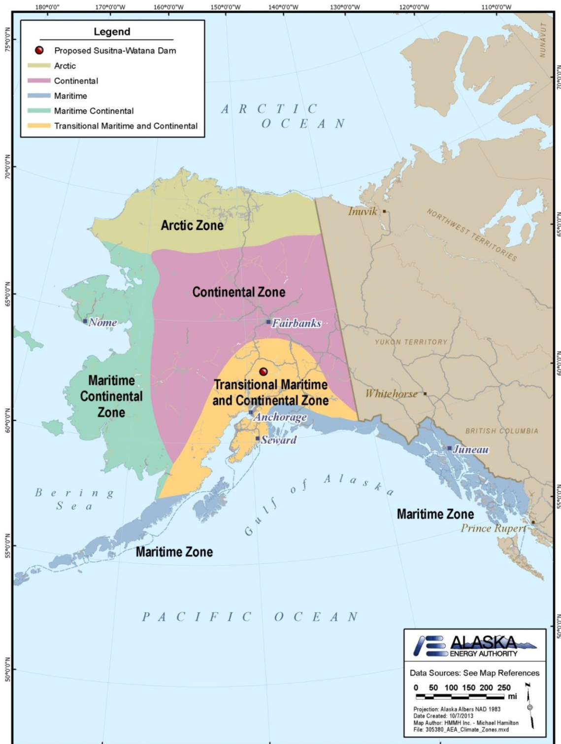
Figure 5.1-1. Alaska Climate Zones