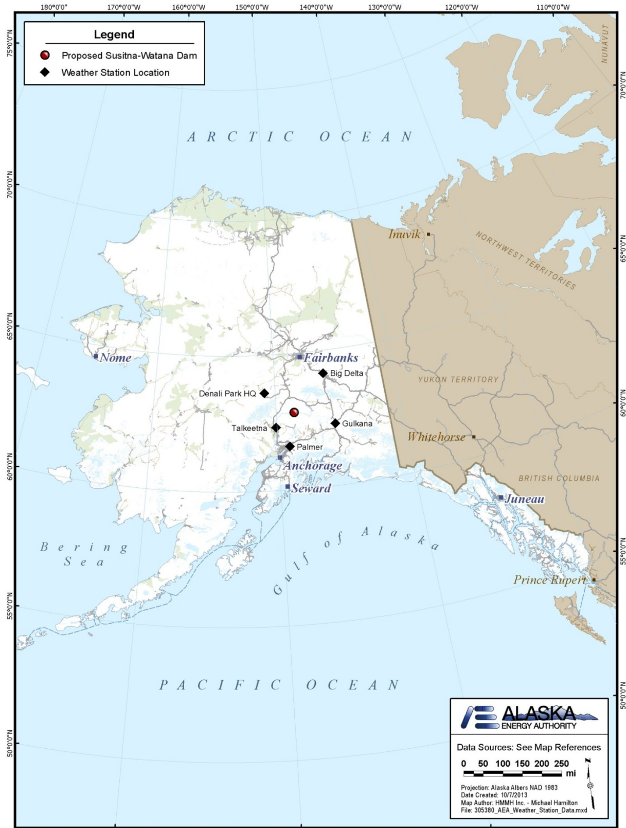
Figure 5.1-2. Weather Station Data Locations Representative of the Project Site