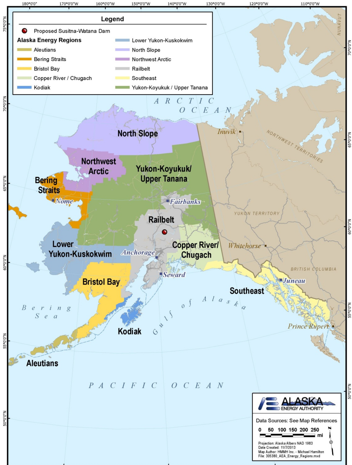
Figure 5.3-5. Alaska Energy Regions