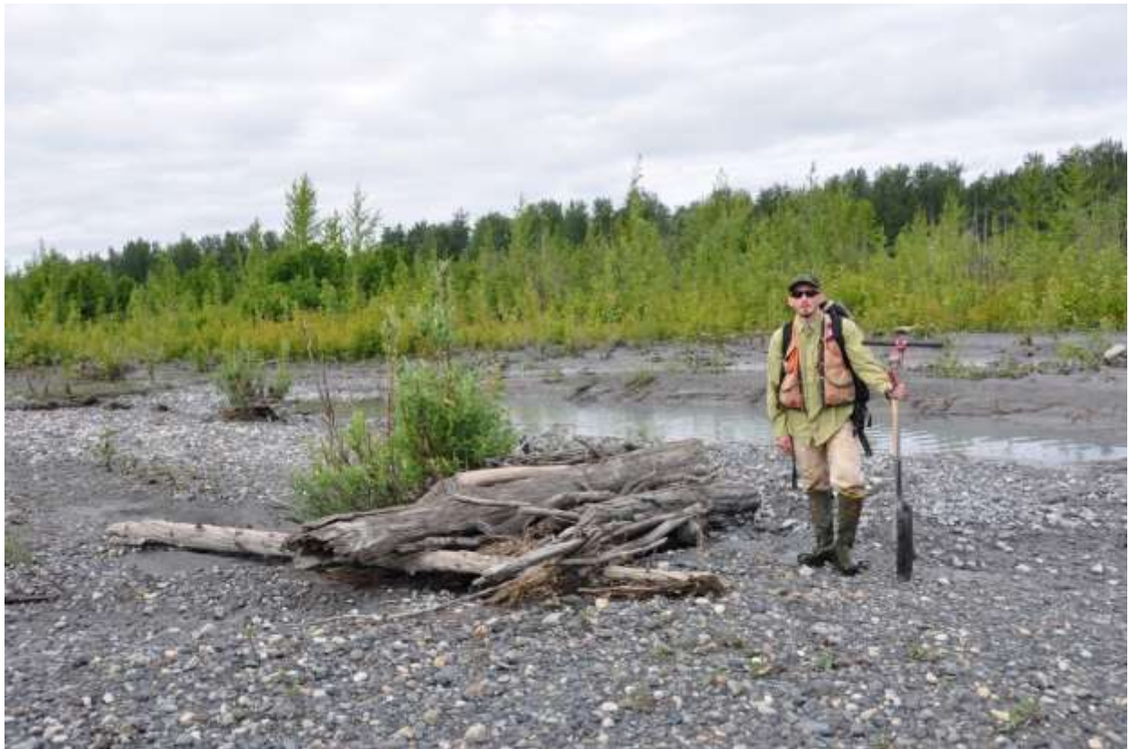
Photograph 32. July 2, 2012 Lower Susitna River below Talkeetna. Typical loose, unstable wood debris.