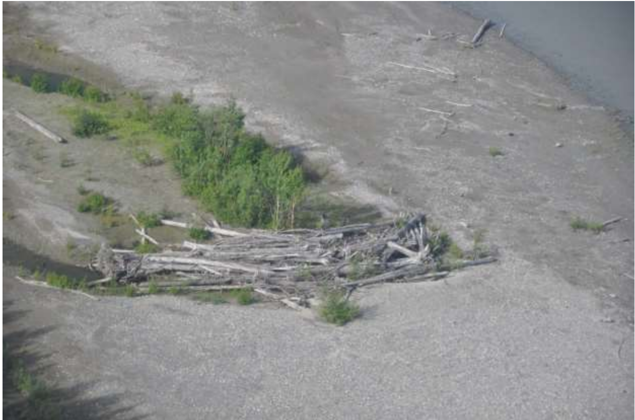
Photograph 35. June 30, 2012 Lower Susitna River between Talkeetna and Willow. Racked wood deposited at young balsam poplar/alder vegetation obstruction.