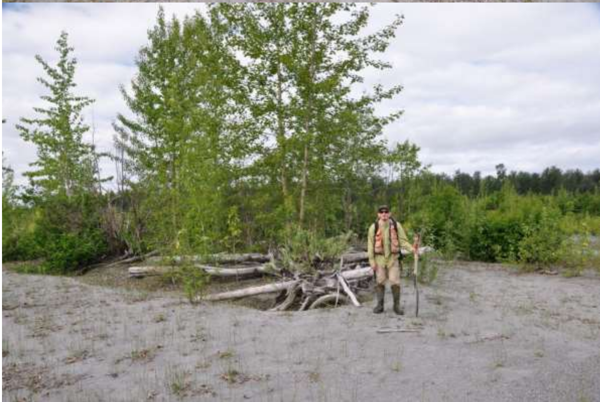
Photograph 26. July 2, 2012 Lower Susitna River below Talkeetna. Bar apex wood jam with buried key member and racked members. Young balsam poplar colonizing elevated wood jam surface.