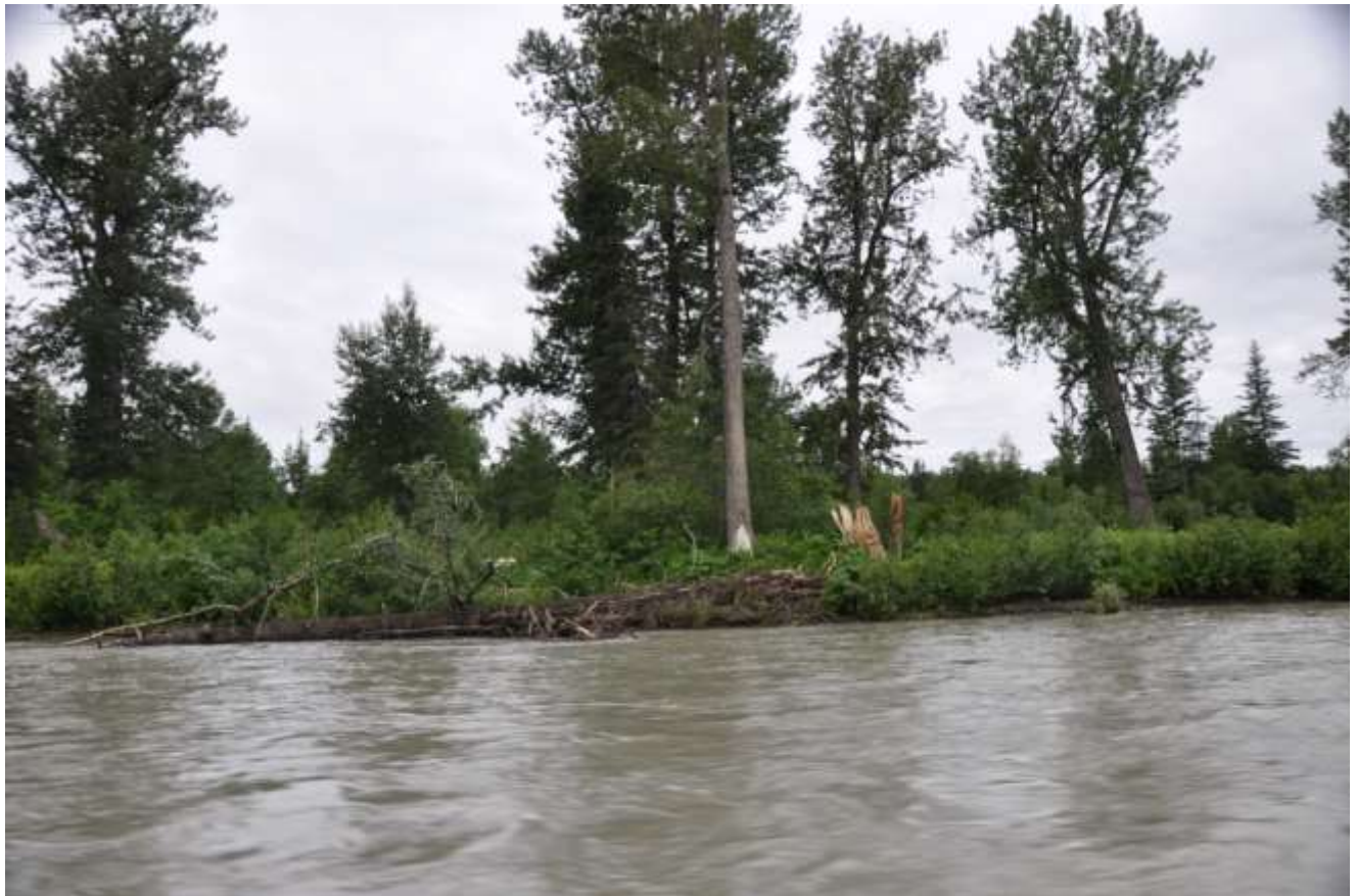
Photograph 3. June 26, 2012 Middle Susitna River between Three Rivers Confluence and Gold Creek. Wind snap balsam poplar recruitment.