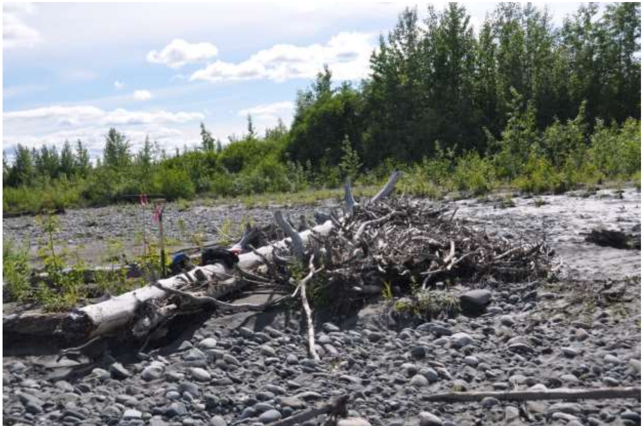
Photograph 36. June 30, 2012 Lower Susitna River between Talkeetna and Willow. Racked wood on mid channel gravel bar.