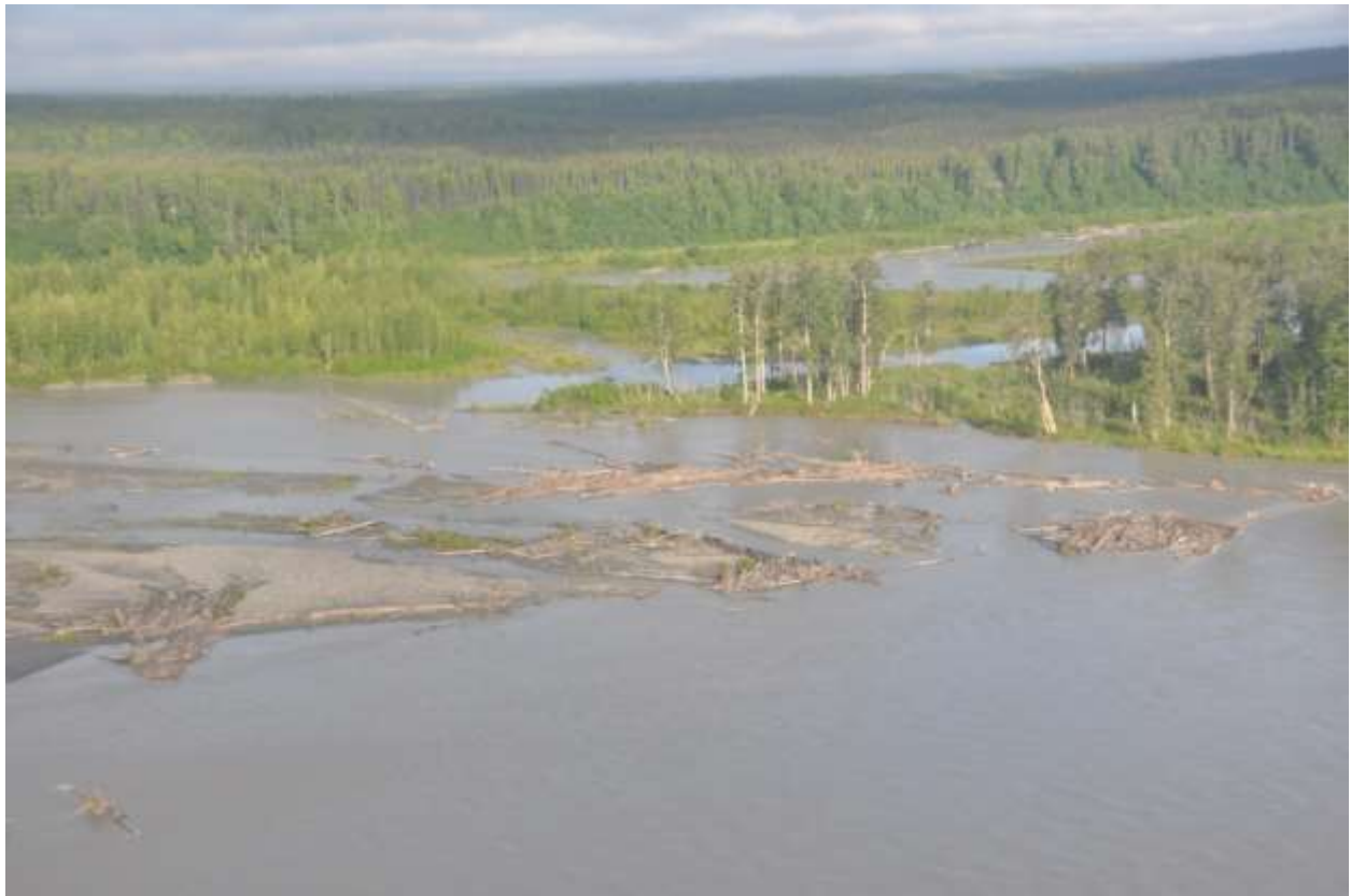
Photograph 33. June 30, 2012 Lower Susitna River between Talkeetna and Willow. Mid channel rafts of wood debris. Flow is from right to left.