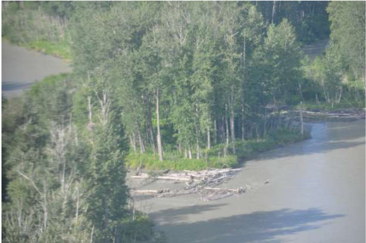
Photograph 25. June 30, 2012 Lower Susitna River between Talkeetna and Willow. Rafts of wood in side channel complex.