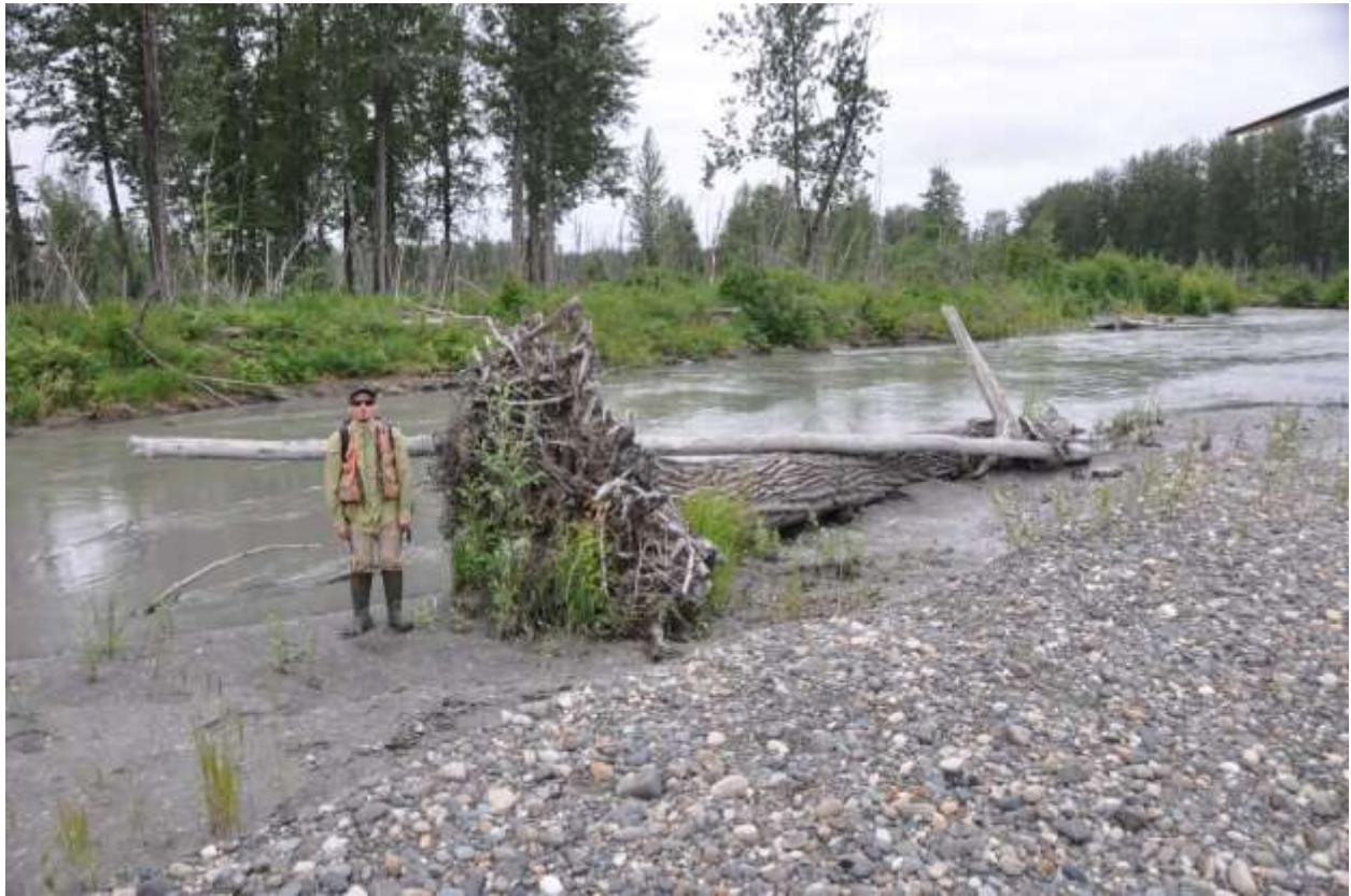
Photograph 11. July 2, 2012 Lower Susitna River below Talkeetna. Large balsam poplar (79 cm diameter, DBH) with root wad (210 cm diameter) and adjacent scour pool formation (Sample Plot T19_04).