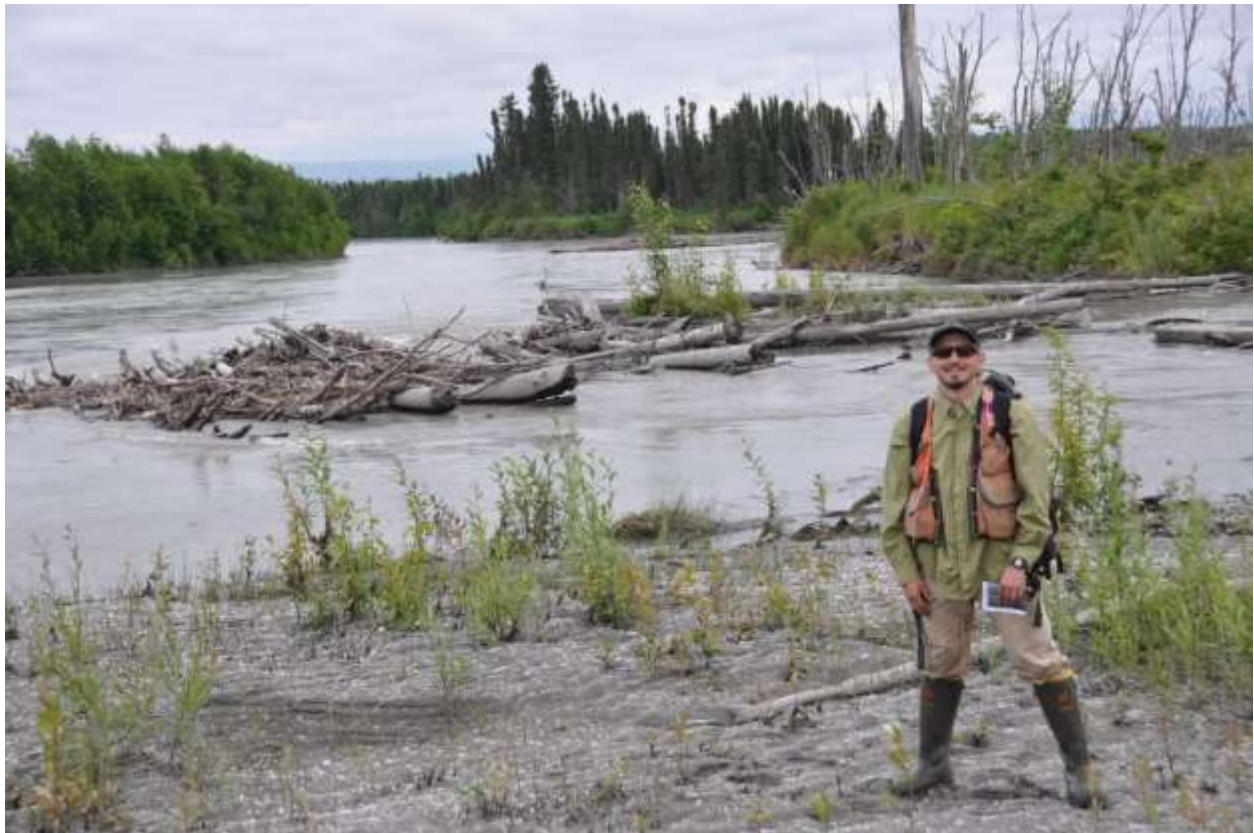
Photograph 18. July 2, 2012 Lower Susitna River between Talkeetna and Willow. Close-up of racked wood debris deposited on side channel gravel bar.