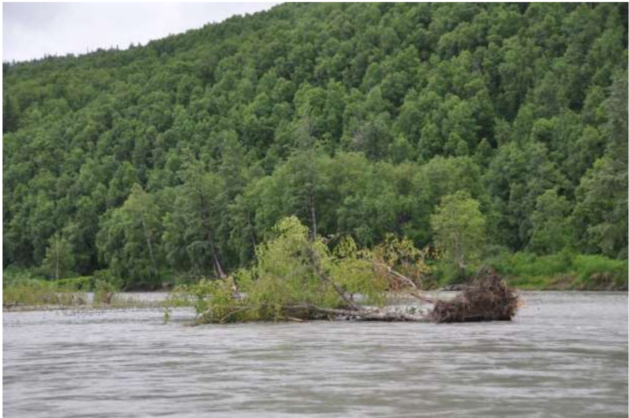
Photograph 8. June 26, 2012 Middle Susitna River wood transport. Paper birch deposited on a mid-channel island bar.