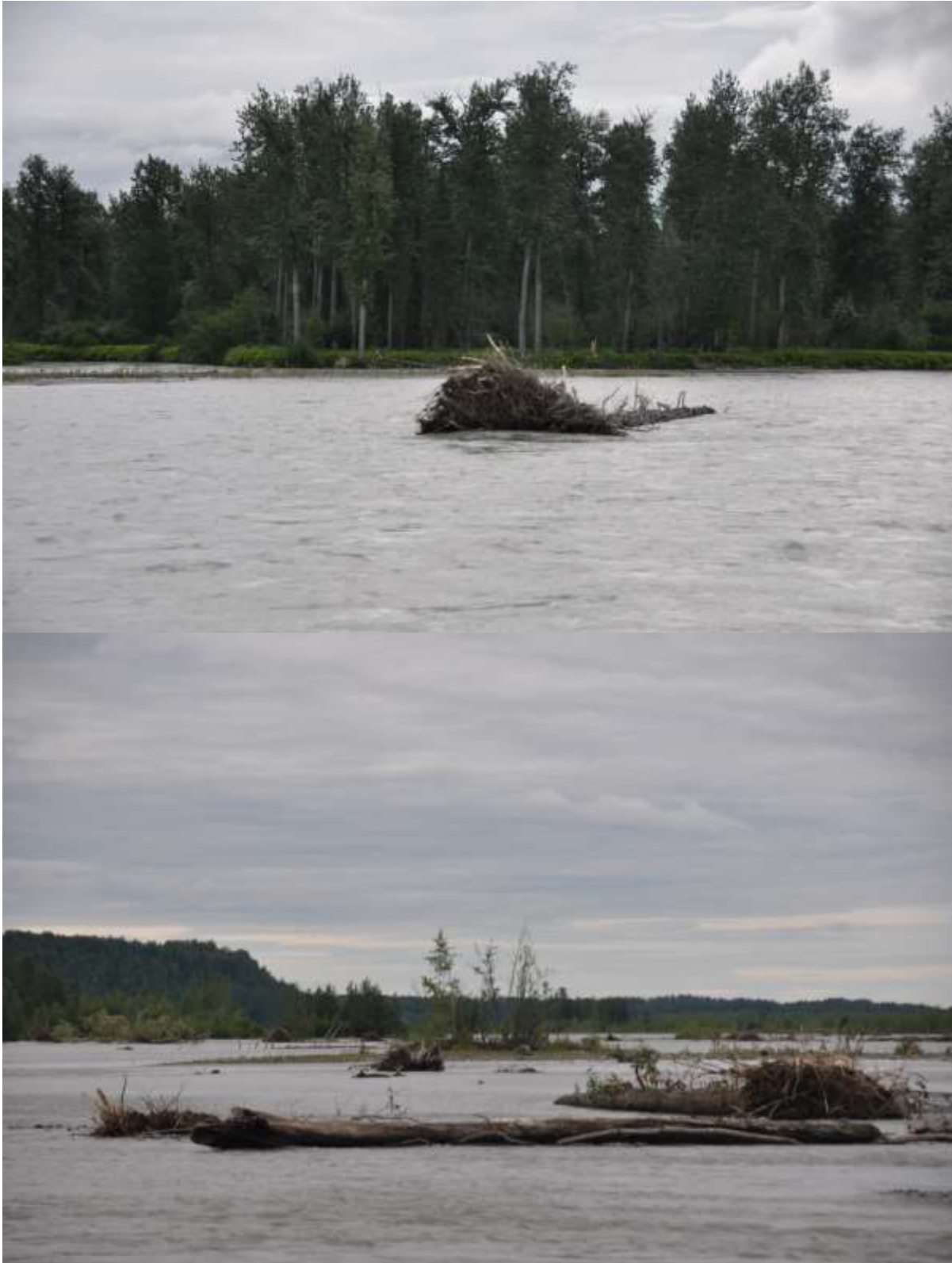
Photograph 6. June 26, 2012 Three Rivers (Susitna, Chulitna, and Talkeetna rivers) Confluence balsam poplar transport.