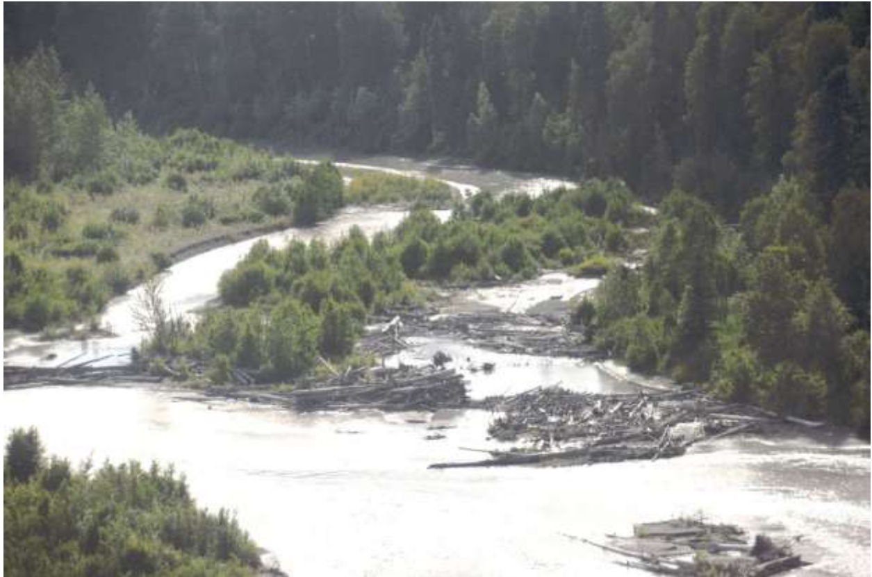
Photograph 16. June 30, 2012 Lower Susitna River below Talkeetna. Rafts of racked and unstable wood. Accumulations at island apex and main stem side-channels.