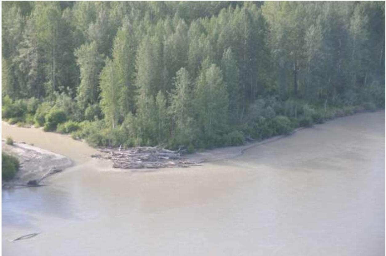
Photograph 24. June 30, 2012 Lower Susitna River between Talkeetna and Willow. Bar apex wood jam at side channel exit.