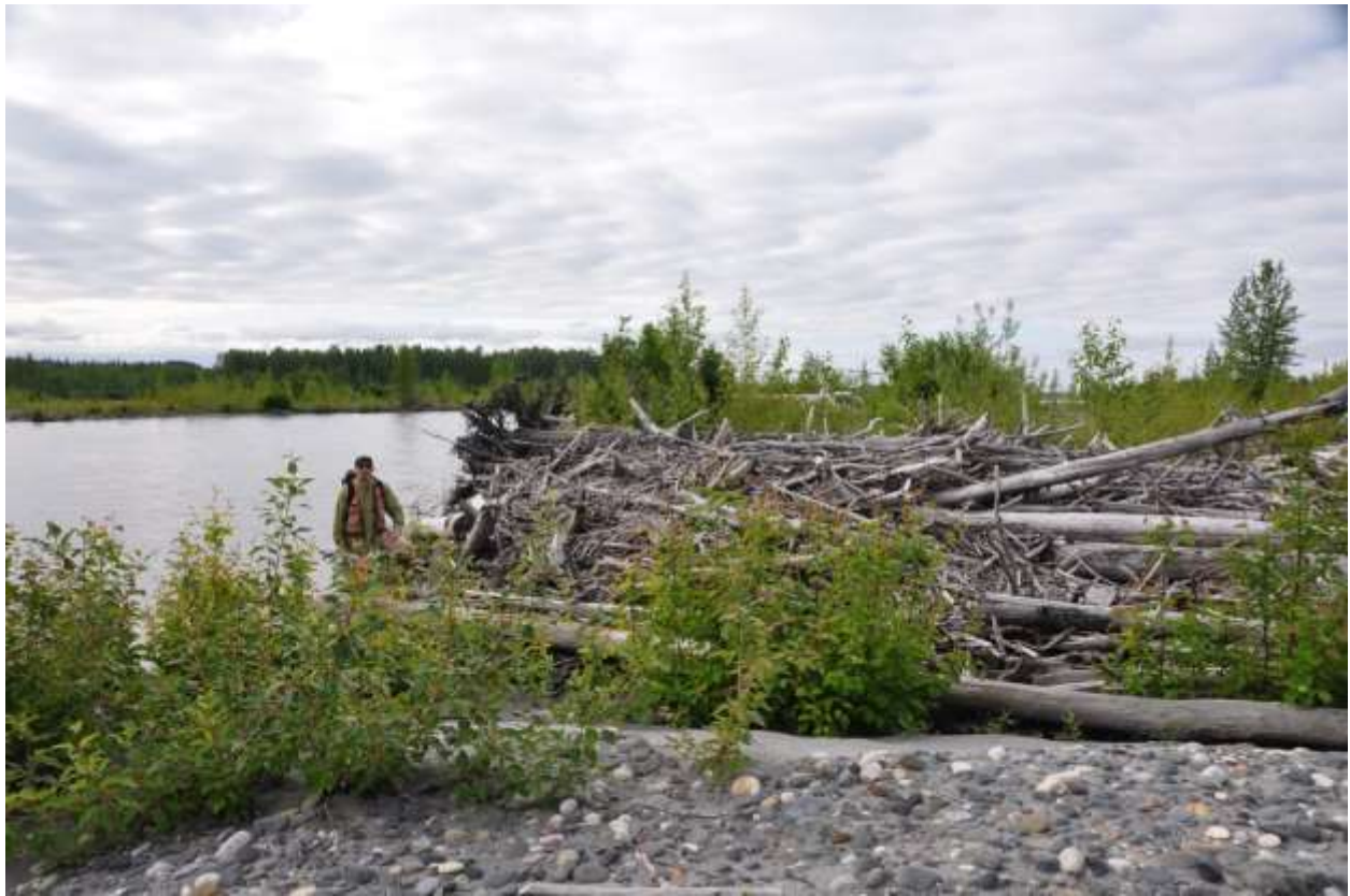
Photograph 12. July 2, 2012 Middle Susitna River near Talkeetna. Wood jam with key and racked members.