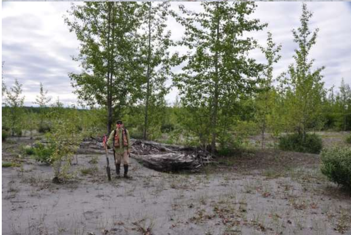
Photograph 14. July 2, 2012 Lower Susitna River near Talkeetna. Partially buried key member with racked members and unstable wood. Young balsam poplar establishment in association with wood jam.