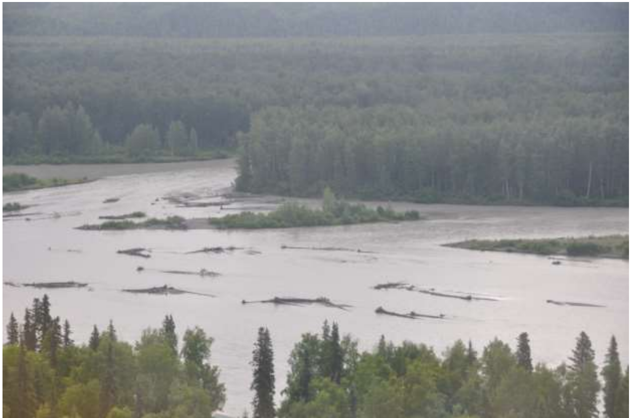
Photograph 10. June 30, 2012 Lower Susitna River between Talkeetna and Willow. Large wood transport and deposition. Root wads are facing upriver. Flow is from left to right.