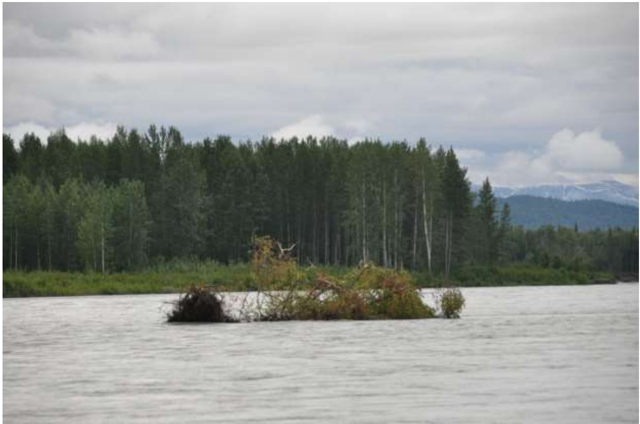
Photograph 7. June 26, 2012 Middle Susitna River immediately upstream of Three Rivers Confluence. Freshly recruited white spruce.