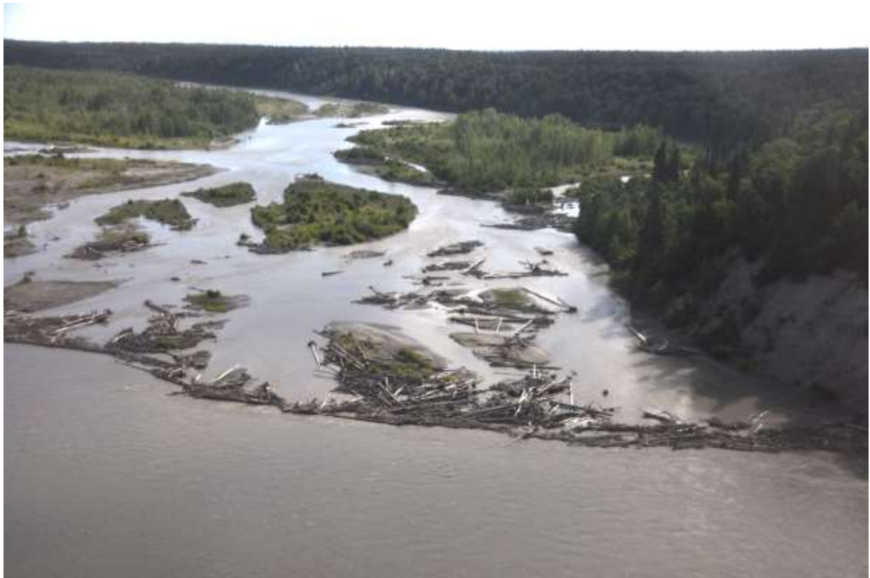
Photograph 21. June 30, 2012 Lower Susitna River between Talkeetna and Willow. Unstable accumulations of racked wood debris upon bars and stable island bar apex jams with racked members.