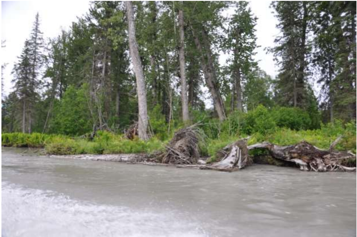
Photograph 27. June 26, 2012 Middle Susitna River above Three Rivers Confluence. In-situ key member forming floodplain bench.