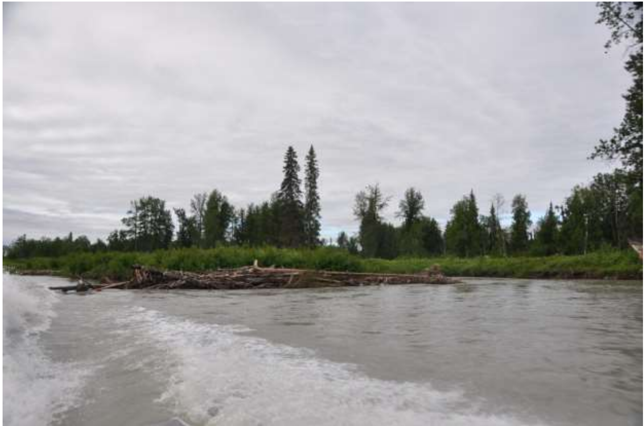
Photograph 13. June 26, 2012 Middle Susitna River wood jam at head of mid channel island and adjacent side-channel.