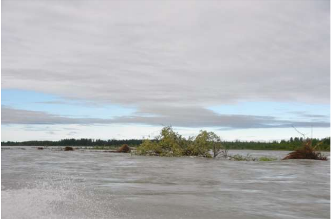
Photograph 5. June 26, 2012 Three Rivers (Susitna, Chulitna, and Talkeetna rivers) Confluence. Fresh recruited balsam poplar transport.