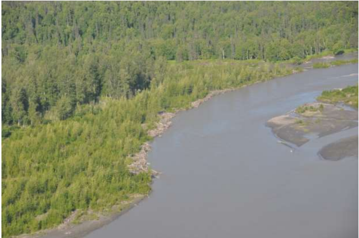
Photograph 30. June 30, 2012 Lower Susitna River between Talkeetna and Willow. Long bench jam with large accumulations of racked wood. Flow is from right to left.