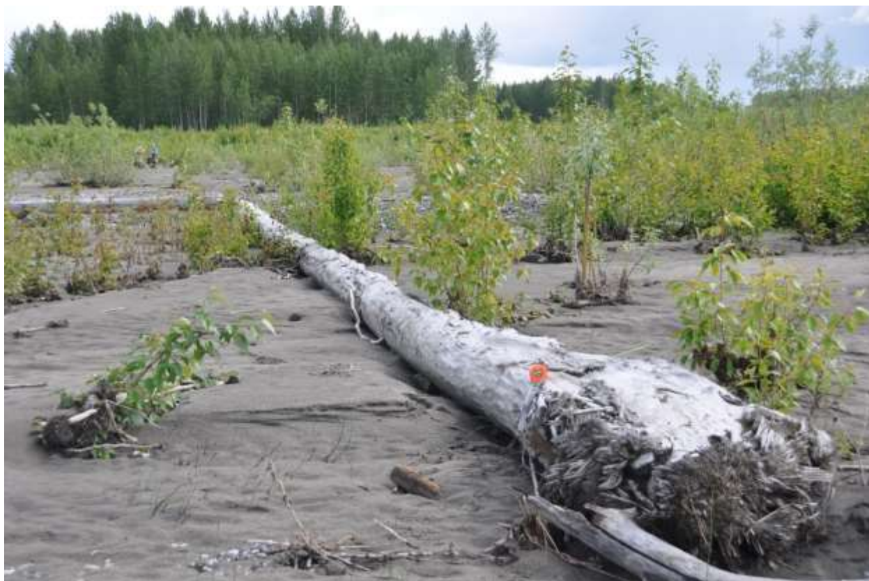
Photograph 31. July 2, 2012 Middle Susitna River immediately above Three Rivers Confluence. Typical unstable wood debris. Note orange tape measure for scale.