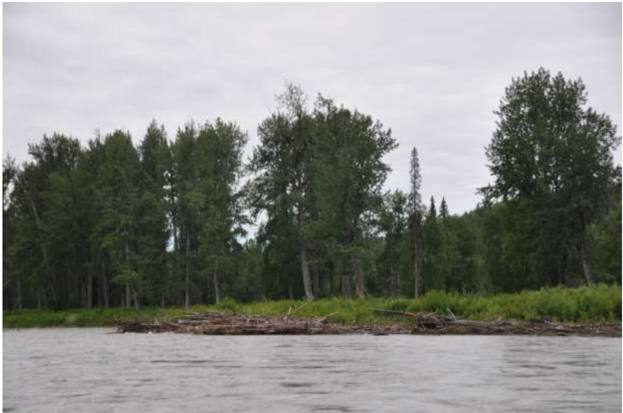
Photograph 28. June 26, 2012 Middle Susitna River above Three Rivers Confluence. Bench jam with racked members.