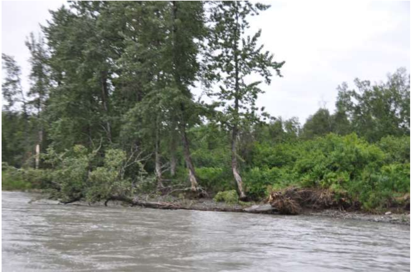
Photograph 2. June 26, 2012 Middle Susitna River between Three Rivers Confluence and Gold Creek. Bank erosion and wind throw balsam poplar wood recruitment.