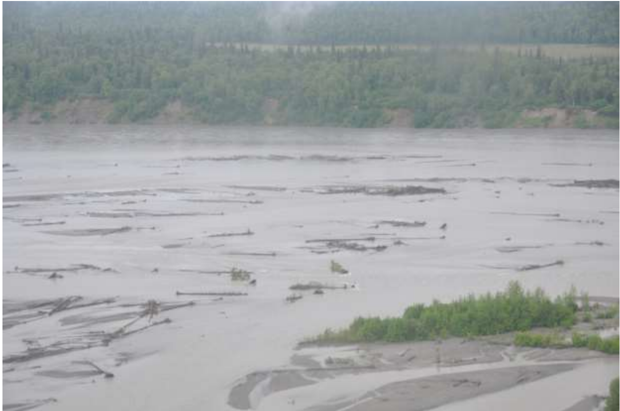
Photograph 9. June 30, 2012 Lower Susitna River between Talkeetna and Willow. Large wood transport and deposition. Root wads are facing upriver. Flow is from right to left.