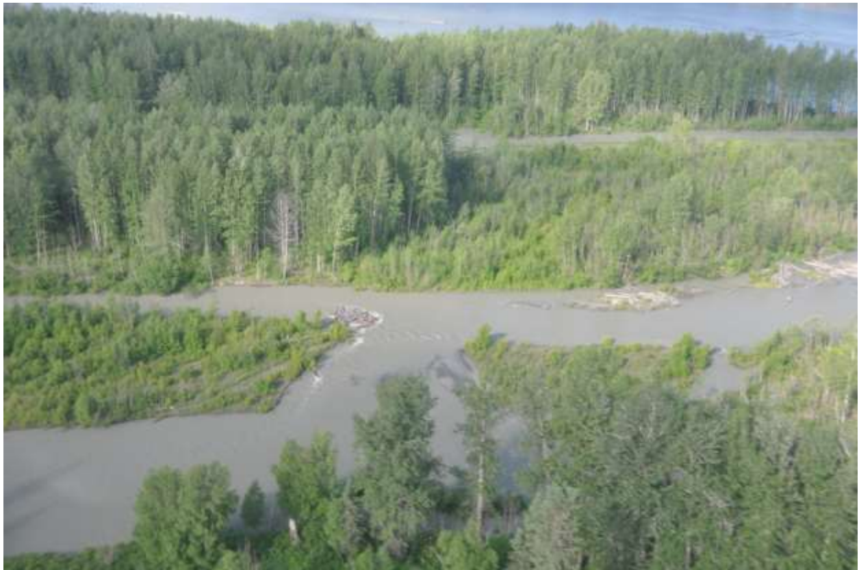
Photograph 23. June 30, 2012 Lower Susitna River between Talkeetna and Willow. Wood jams in side channel complex.