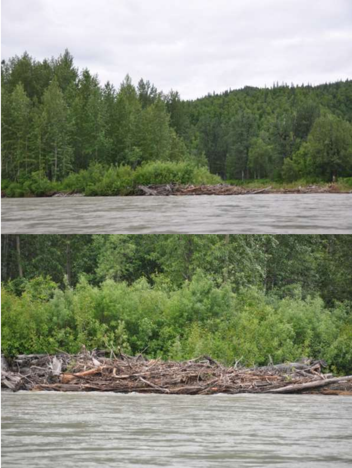
Photograph 15. June 26-27, 2012 Middle Susitna River above Three Rivers Confluence. Wood jam located at island apex and side channel entrance. Lower Photograph close up of wood jam with small diameter racked and loose members.