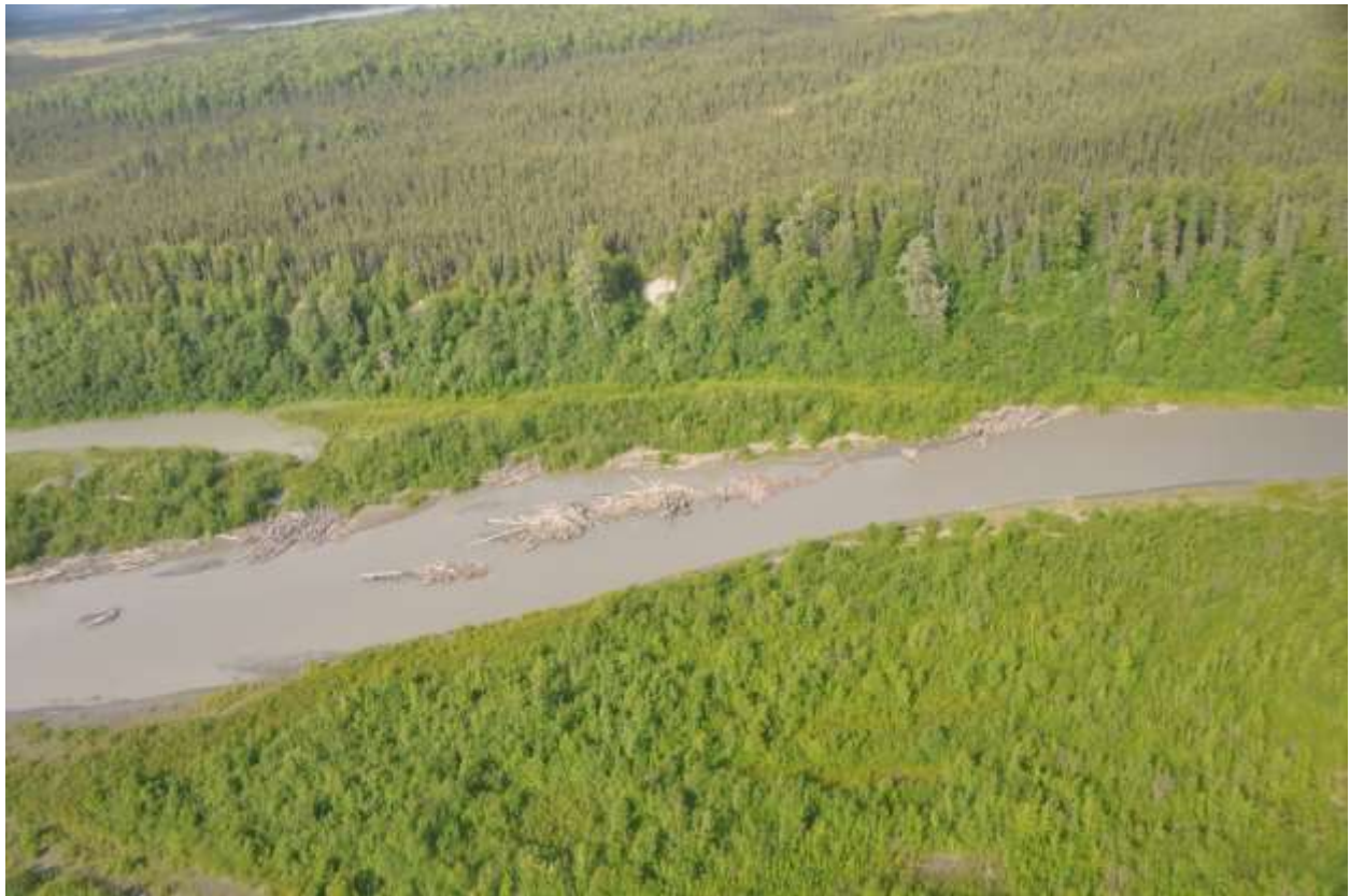
Photograph 17. July 2, 2012 Lower Susitna River side channel between Talkeetna and Willow. Rafts of wood debris in side channel and along floodplain embankment.