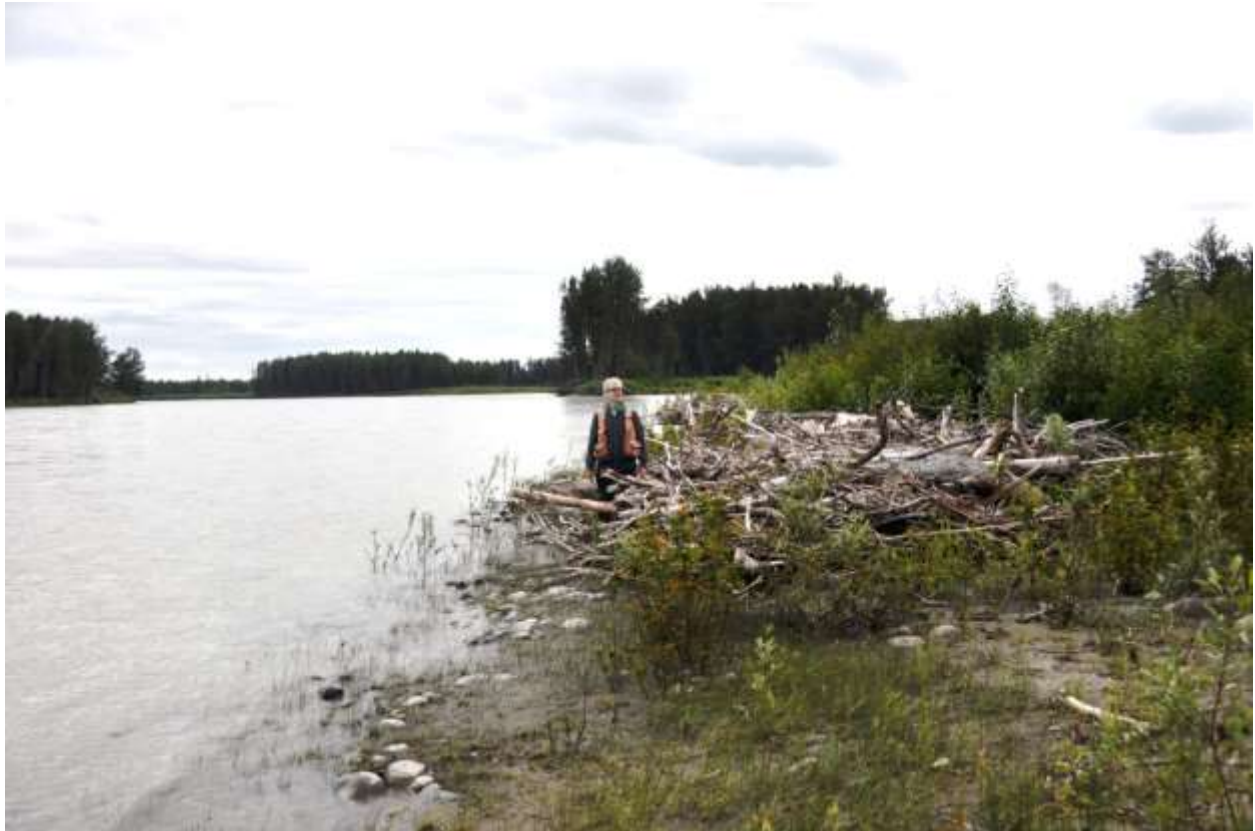
Photograph 29. July 1, 2012 Middle Susitna River immediately above Whiskers Slough. Bar apex jam with large accumulation of racked members upstream of jam.