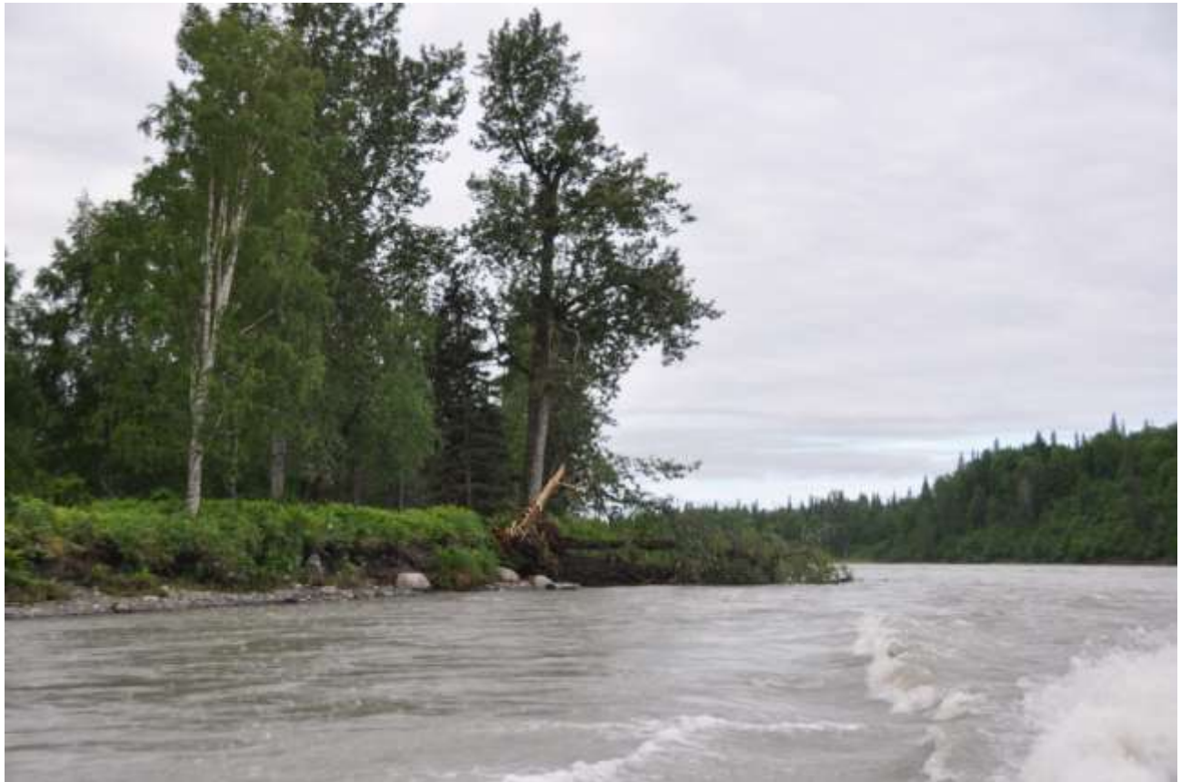
Photograph 1. June 26, 2012 Susitna Middle River between Three Rivers Confluence and Gold Creek. Wind snapped and wind throw balsam poplar recruitment to channel.