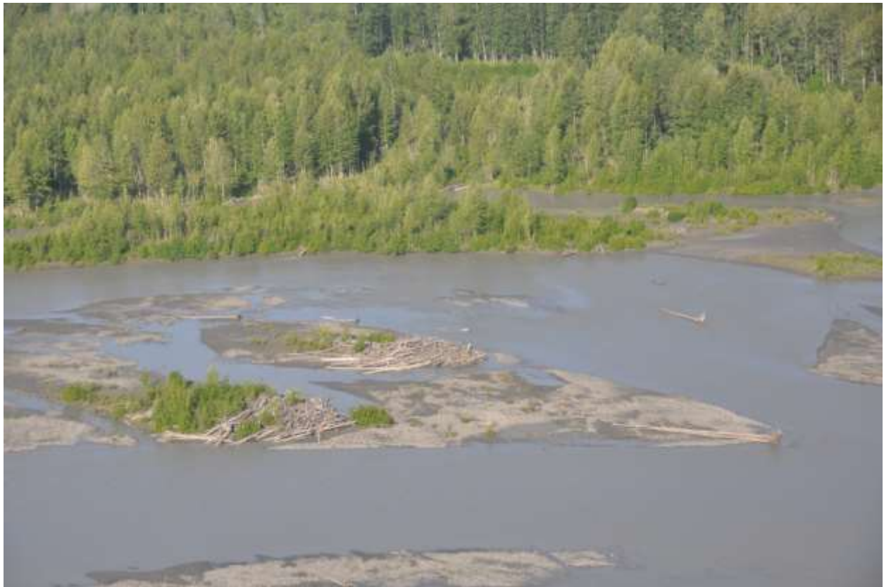
Photograph 20. June 30, 2012 Lower Susitna River between Talkeetna and Willow. Racked wood on mid channel islands.