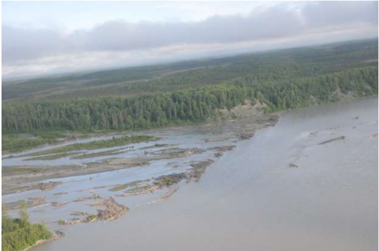
Photograph 34. June 30, 2012 Lower Susitna River between Talkeetna and Willow. Rafts of racked wood debris.