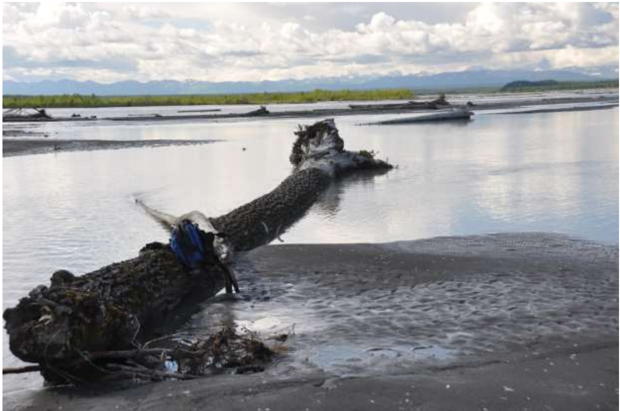
Photograph 37. June 30, 2012 Lower Susitna River at Talkeetna immediately below Three Rivers Confluence. Balsam poplar (85 cm diameter, DBH; 18 m length; Plot T19).