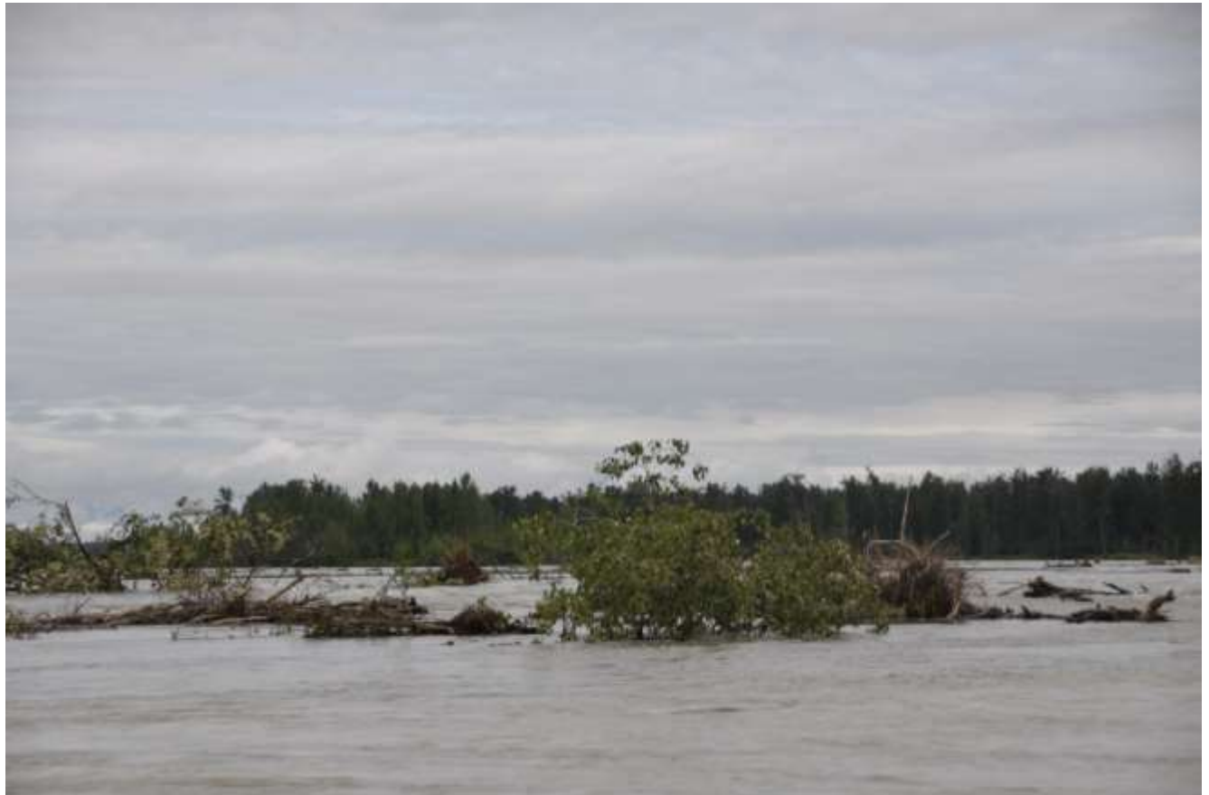
Photograph 4. June 26, 2012 Three Rivers (Susitna, Chulitna, and Talkeetna rivers) Confluence. Fresh recruited balsam poplar transport.