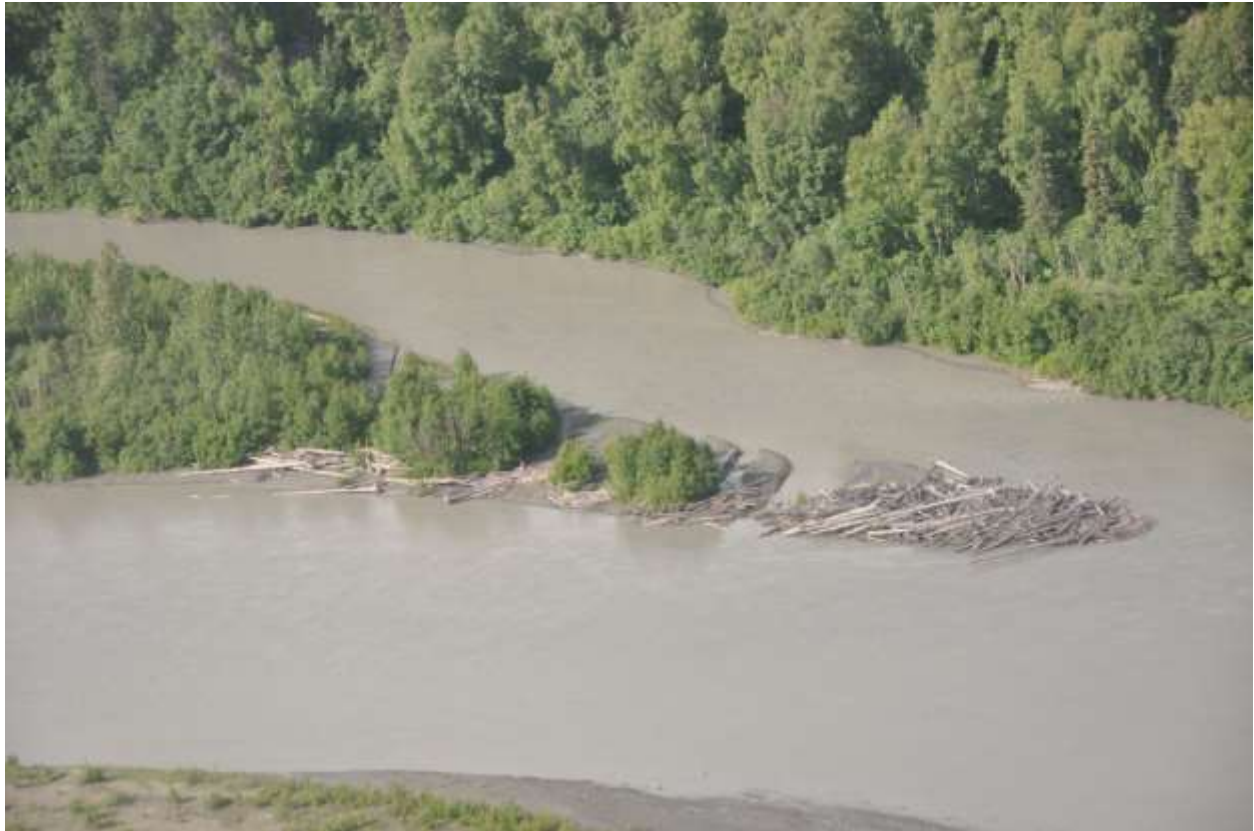
Photograph 19. July 2, 2012 Lower Susitna River between Talkeetna and Willow. Racked wood debris at island apex and side channel.