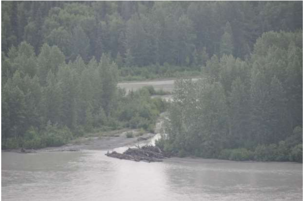
Photograph 22. June 30, 2012 Lower Susitna River between Talkeetna and Willow. Bar apex wood jam with racked members at island apex and side channel entrance.