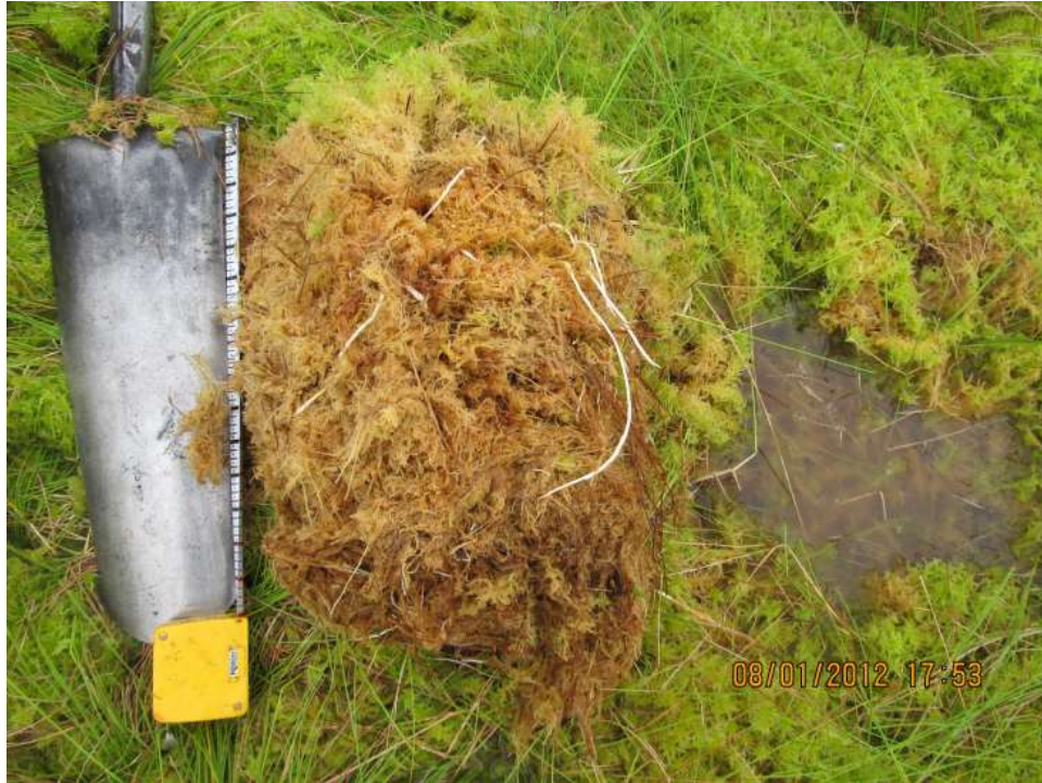
Figure 3. Hydric soil indicator: A1 (Histosol) in the wetland mapping study area, 2012.