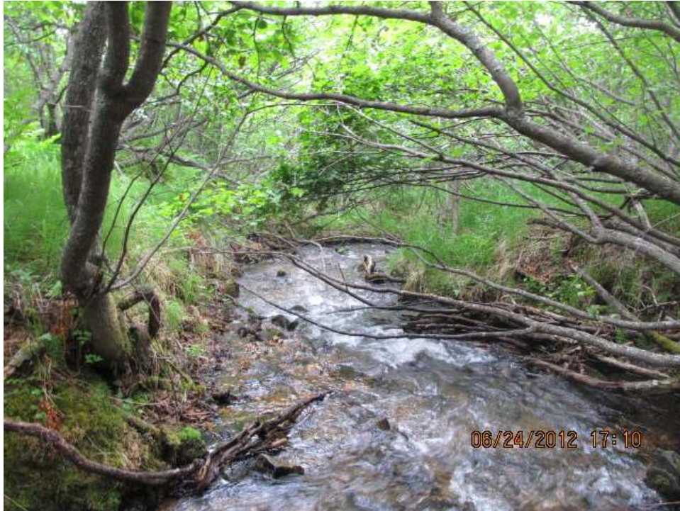
Figure 5. Typical R3UBH wetland (upper perennial stream) in the wetland mapping study area, 2012.