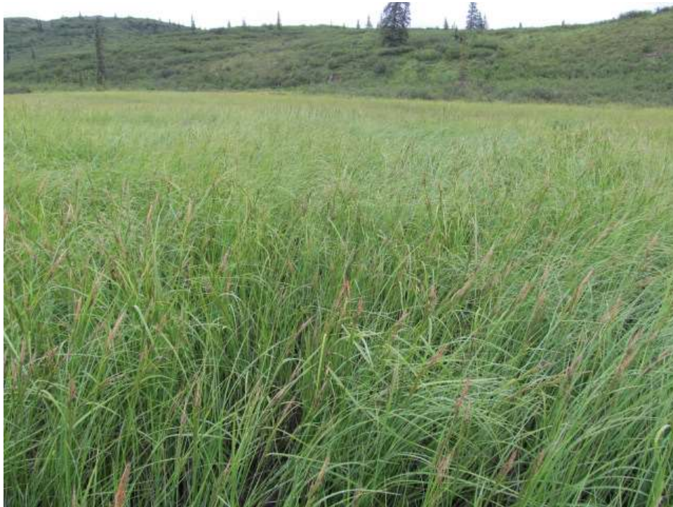
Figure 6. Typical PEM1E wetland (wet sedge meadow) in the wetland mapping study area, 2012.