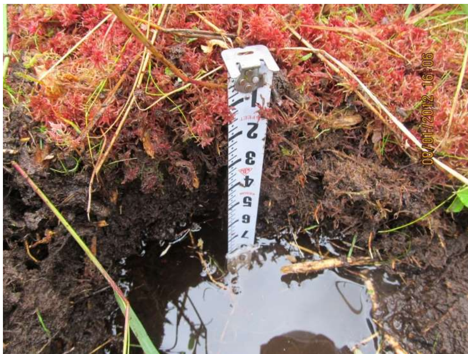
Figure 4. Wetland hydrology indicators: A1 (High Water Table) and A2 (Saturation) in the wetland mapping study area, 2012.