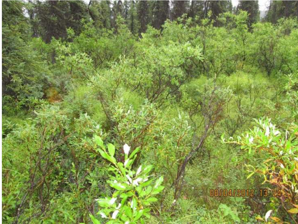
Figure 7. Typical PSS1B wetland (willow scrub) in the wetland mapping study area, 2012.