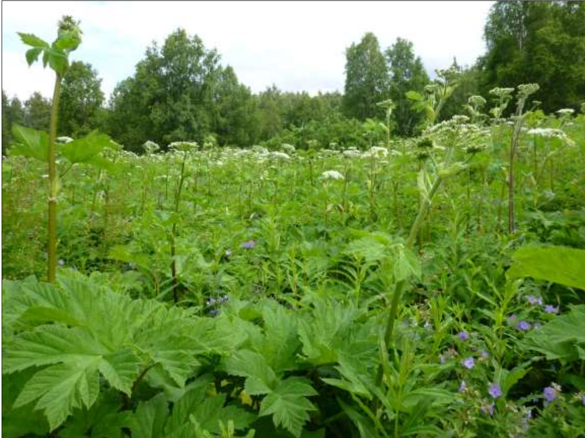
Figure 4. Large Umbel Meadow, Riparian Vegetation Study area, Susitna River floodplain, Alaska, 2012. Vegetation in photo is approximately 1.5–2.0 meters (4.9–6.6 feet) tall.