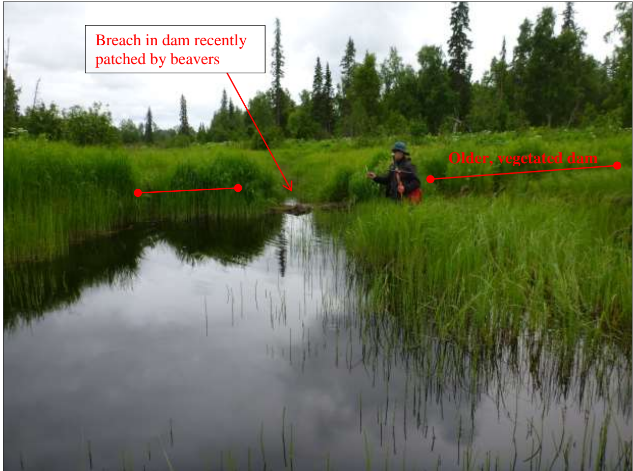
Figure 10. Beaver impoundment showing older, vegetated dam with breach recently maintained by beavers, Riparian Vegetation Study area, Susitna River floodplain, Alaska, 2012.