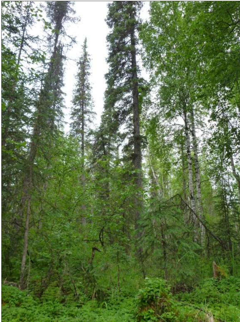
Figure 3. Open Spruce–Paper Birch forest, Riparian Vegetation Study area, Susitna River floodplain, Alaska, 2012.