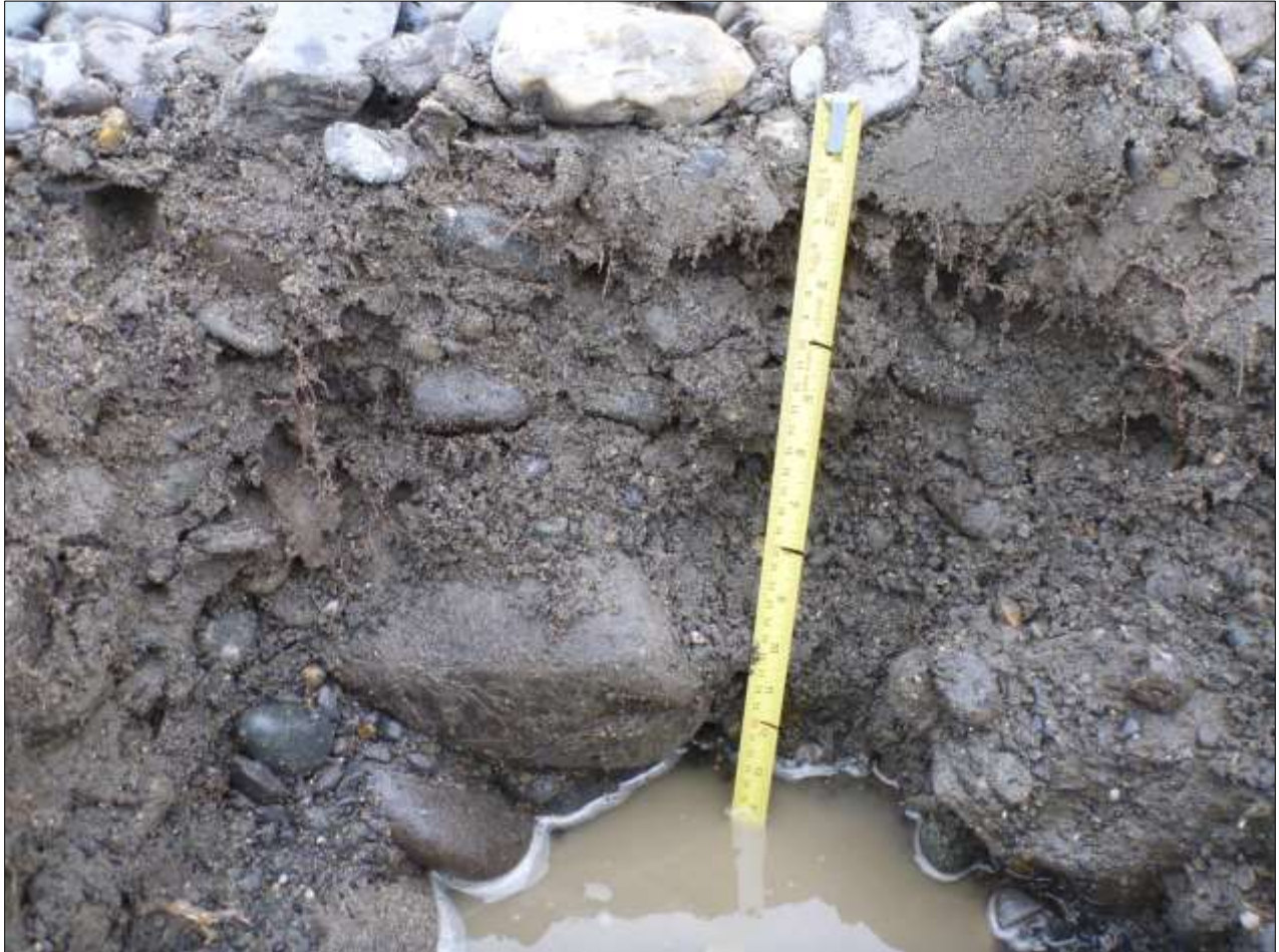
Figure 6. Oxyaquic Cryorthents on an active cobble bar showing water table at 35 centimeter (14 inches) below soil surface, Riparian Vegetation Study area, Susitna River floodplain, Alaska, 2012.