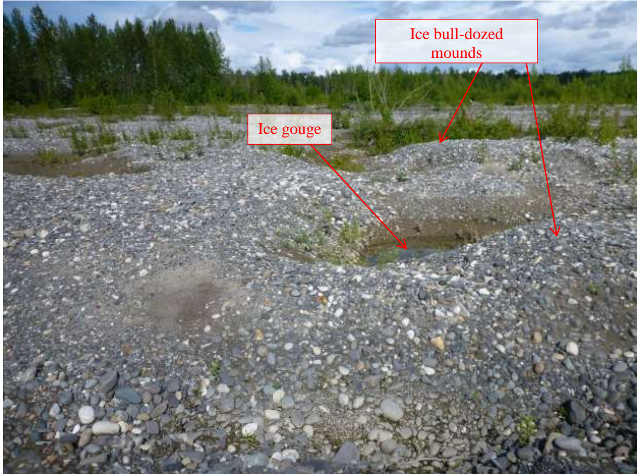
Figure 8. Recent ice gouging and ice bull-dozing on a mid-river gravel bar, Riparian Vegetation Study area, Susitna River, Alaska, 2012.