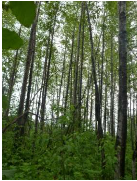
Figure 2. Open Balsam Poplar Forest showing the sapling (left) and timber (right) successional stages, Riparian Vegetation Study area, Susitna River floodplain, Alaska, 2012.