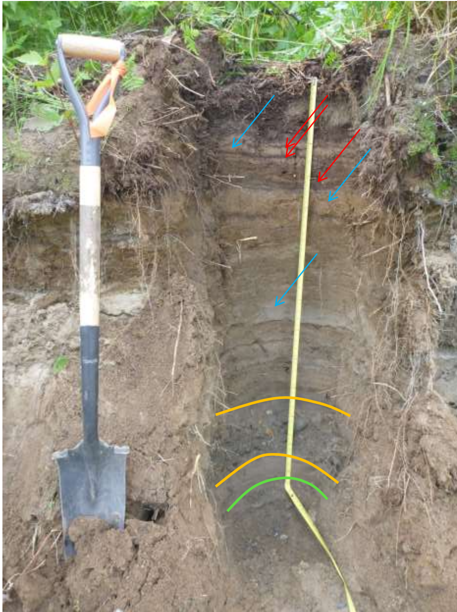
Figure 5. Typical Cryofluvents at a river bank exposure, Riparian Vegetation Study area, Susitna River floodplain, Alaska, 2012.

Dark horizontal lines (red arrows) indicate layers of organic material buried by periodic past sedimentation events. Orange and grayish layers (blue arrows) are riverine sands and silts. Cobbly/gravelly layer (between orange lines) indicates historic large, powerful flood event. The cobbly layer at the bottom of the pit represents the original cobbles bar surface (below green line). Shovel in photo is approximately 1 meter (3.3 feet) tall.