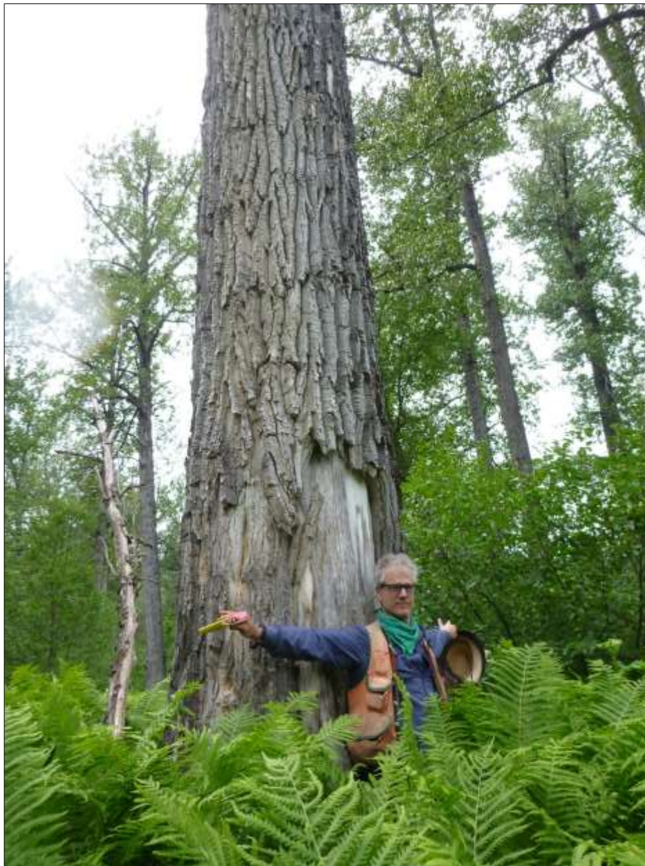
Figure 7. Ice scar on balsam poplar, Riparian Vegetation Study area, Susitna River floodplain, Alaska. Scientist in photo is ~1.9 meter (6.2 feet) tall.