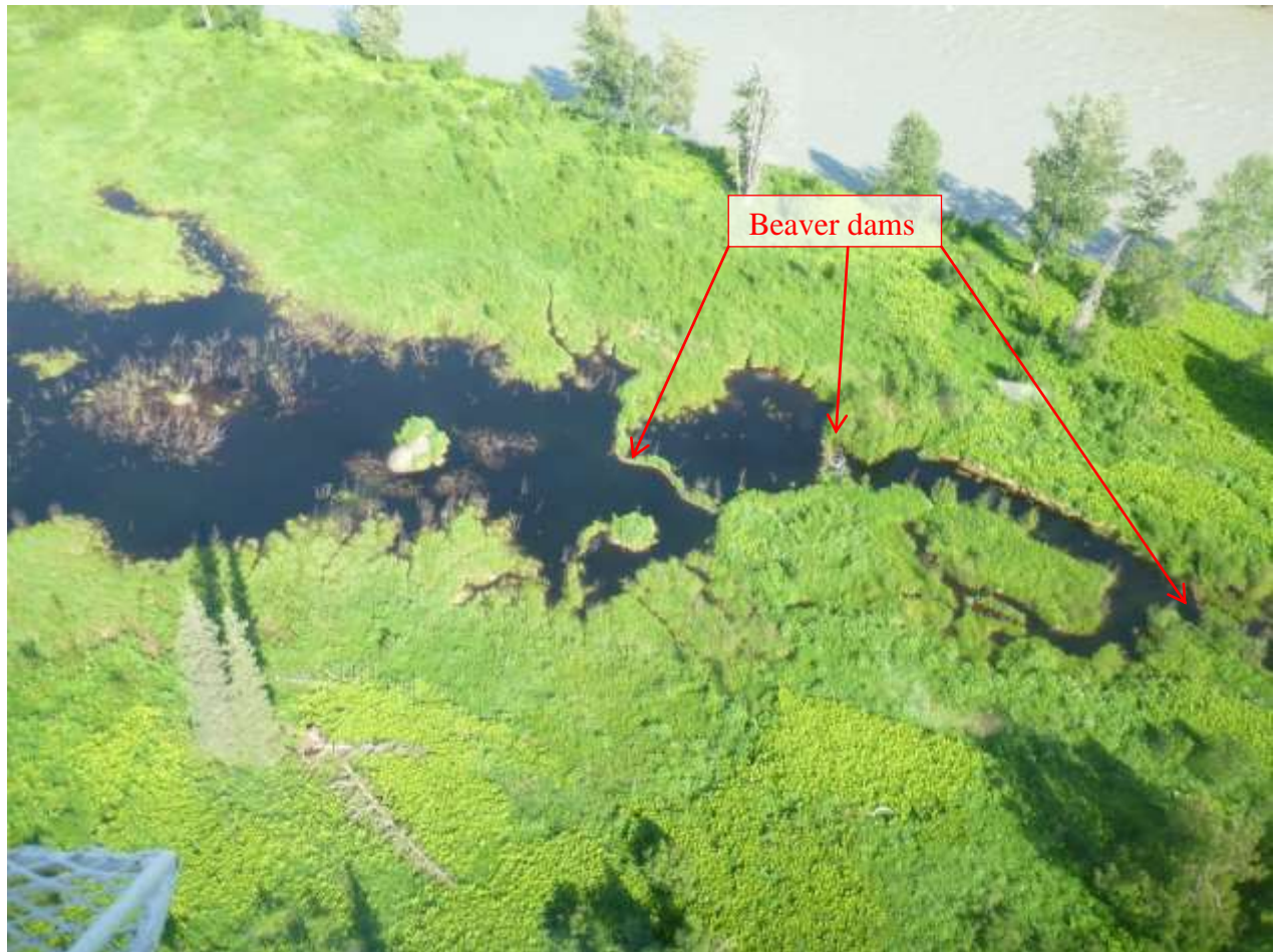
Figure 9. Aerial view of beaver pond complex, Riparian Vegetation Study area, Susitna River floodplain, Alaska, 2012.