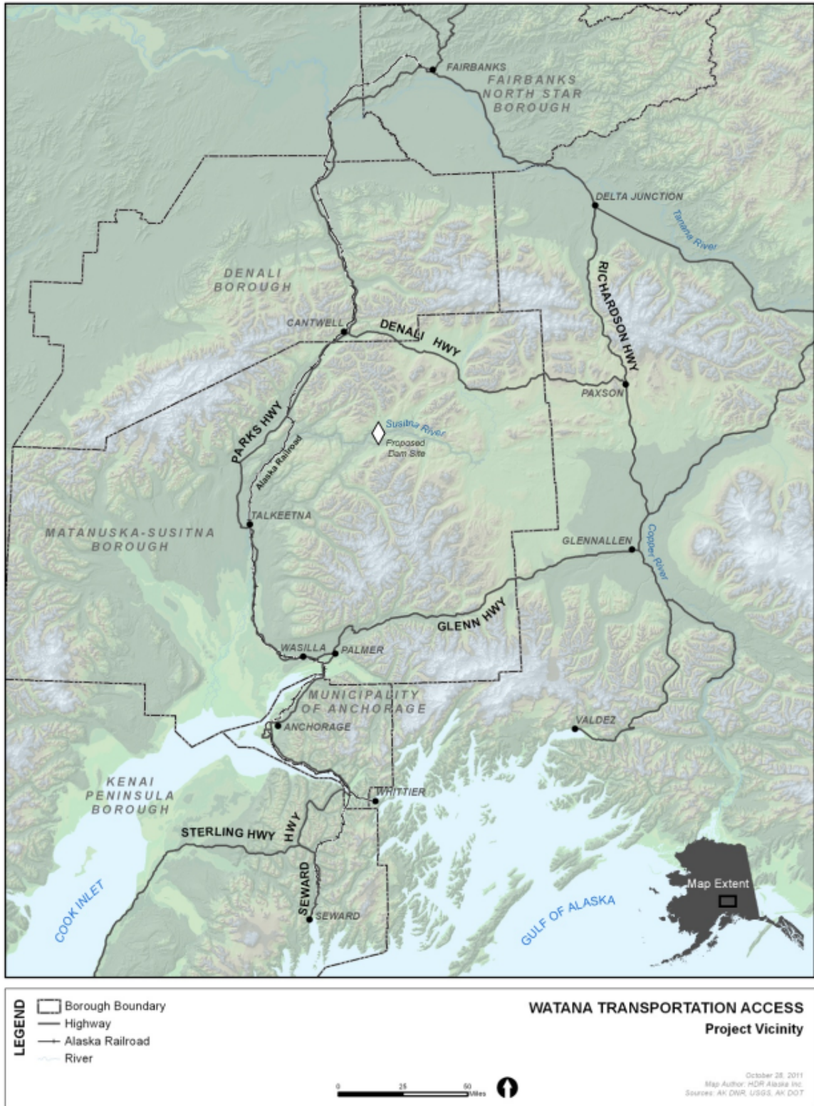
Figure 1-1. Location and vicinity map