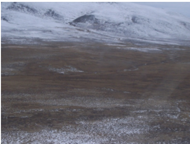
Figure 3-6. Deadman Mountain

At MP 14.8, the corridor runs parallel to Brushkana Creek for a short distance before turning south to ascend up to a higher valley along the western edge of Deadman Mountain. The