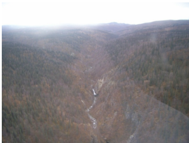
Figure 3-2. Example of a steep ravine to be crossed in the Gold Creek variant

The South Rail corridor is based on the rail corridor shown in Figures B6, B7, and B8 of the 1982 Access Planning Study Supplement . It would leave the ARRC Gold Creek Station (ARRC MP 263) proceeding northeast to start the 17-mile traverse along the north-facing slope of the southern bank of the Susitna River. Twenty miles from Gold Creek Station, the alignment would turn south to ascend the side of a narrow deep ravine. After passing the headwaters of this