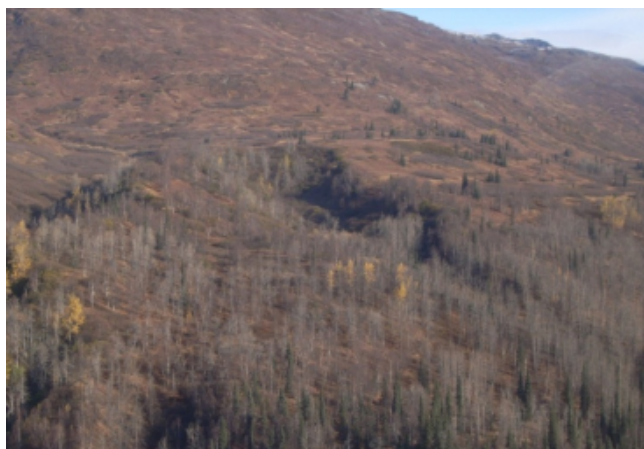
Figure 3-3. West slope above Portage Creek Valley