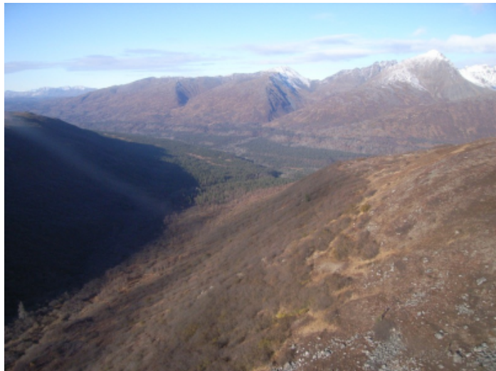
Figure 3-4. Steep ravine crossing over to Devil Creek

The Hurricane (West) alternative is based on the North-Access Plan 13 alternative from the September 1982 Access Planning Study Supplement . The alternative is approximately 51.7 miles long and is all new construction. The proposed alternative starts on the Parks Highway near Milepost 171, which is across from the ARRC Hurricane station (ARRC MP 282). At 1,750 feet, this is also the lowest point on the alignment. Leaving the Parks Highway, the alternative heads east toward the Talkeetna mountains for 1.3 miles.