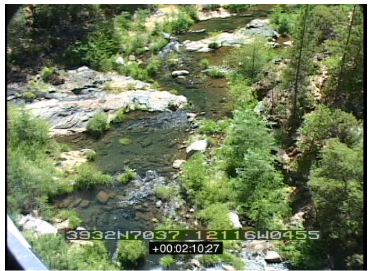
Figure FS4- 2. Example of expected image quality from an aerial video still also displaying onscreen GPS and time stamp.

AEA has a high level of confidence in the expected quality of the aerial video and its ability to translate into the required deliverables as it is analyzed. However, if during initial surveys it appears that the video may not provide a high enough level of resolution, habitat mapping emphasis will be shifted to on-the-ground mapping.